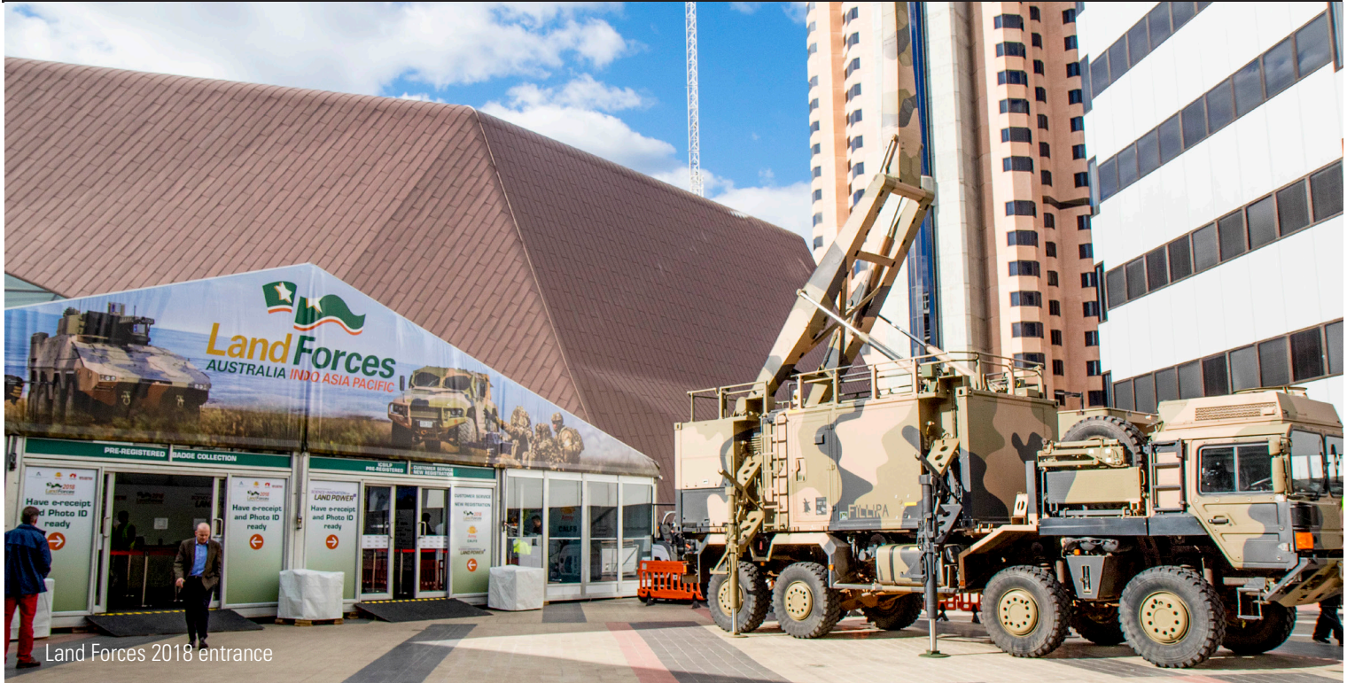
Land Forces 2018 entrance

The biennial Land Forces Exposition, the nation's premier defence industry event, returned to the Adelaide Convention Centre (ACC), 4 – 6 September, 2018. Building on the success of the 2016 event (also held in Adelaide), Land Forces 2018 eclipsed previous attendance and exhibitor figures, with a record 15,331 total combined international, national and local attendances (up from 13,450 in 2016), along with 624 participating exhibitor companies (a 25% increase on the previous event).