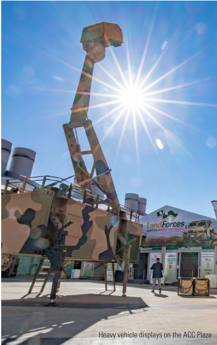
Heavy vehicle displays on the ACC Plaza

To cope with the large number of deliveries (316 semi-trailers of equipment), the ACC's Exhibitions Team put traffic management in place, arranging for freight staging at the nearby Adelaide Entertainment Centre. In addition, the team arranged to shut down one lane of North Terrace to accommodate oversized vehicles. Thorough pre-planning ensured that deliveries remained on time – critical to ensuring the exhibition opened as scheduled.