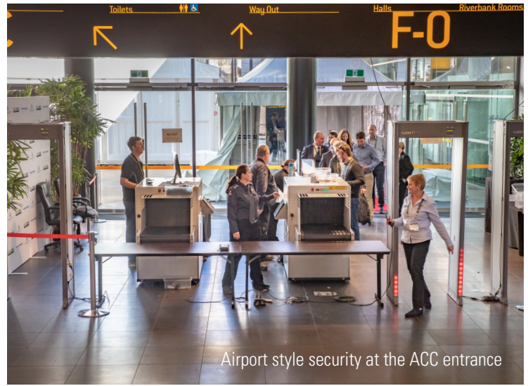
Airport style security at the ACC entrance