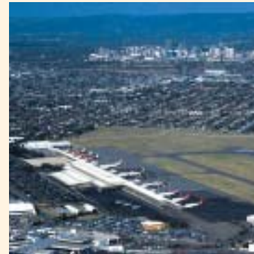
The Airport remains 15 minutes from the CBD.

Gone is the claustrophobic, closed in gloom and clutter of the usual airport terminal.