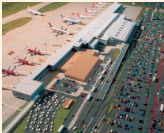
Adelaide Airport scale model of the new development.