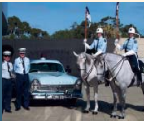
Our Police had a ceremonial presence during the launch at the Adelaide Convention Centre. Historic patrol car with the legendary Police Greys.