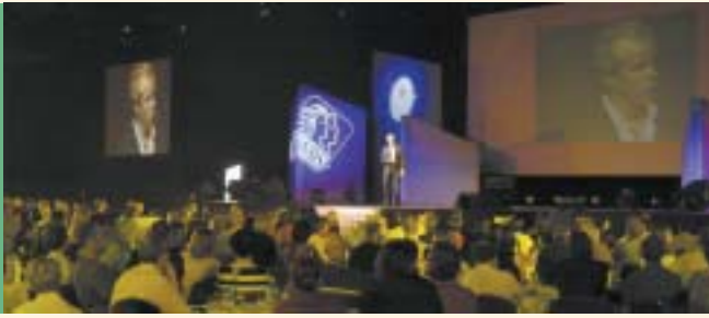
Left: 2005 Neways Pacific Rim Convention.