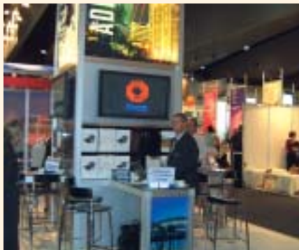
ACC at the SA stand - AIME 2005.