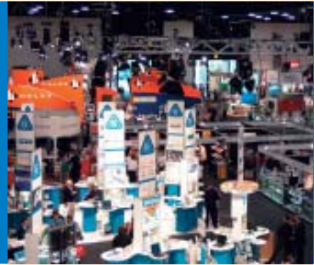
Right: Australian Dental Association National Conference & Exhibition.