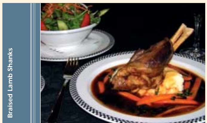
Braised Lamb Shanks

Serves four people with winter vegetables or salad, and a four year old Cabernet.