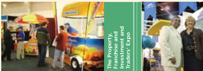
The Property, Franchise and Investment and Traders' Expo