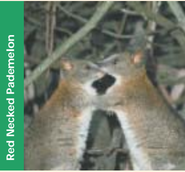
Red Necked Pademelon