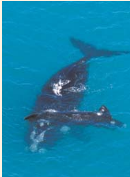
Whales often come close to South Australian beaches

offering guests an enjoyable dinner, the nocturnal walk, a night's stay in the Homestead and next morning a guided dawn walk to see an entirely different range of animals and birds. Available to all is the "Adelaide Wildlife Trail" which includes ten completely differing wildlife venues, including those just mentioned, extending from our open range zoo which contains endangered world species, extending to an exciting "shark experience".