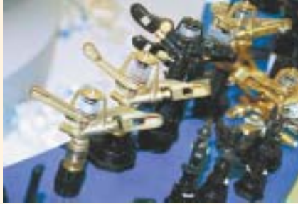
A wide range of irrigation equipment on display